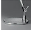
TOLOMEO BASE D 200 ALL A008600