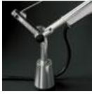
TOLOMEO SUPP.TAVOLO FISSO A004200