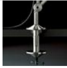
TOLOMEO MORSETTO A004100